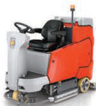
Scrubmaster B175 R