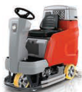
Scrubmaster B120 R