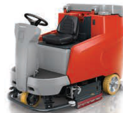
Scrubmaster B260 R