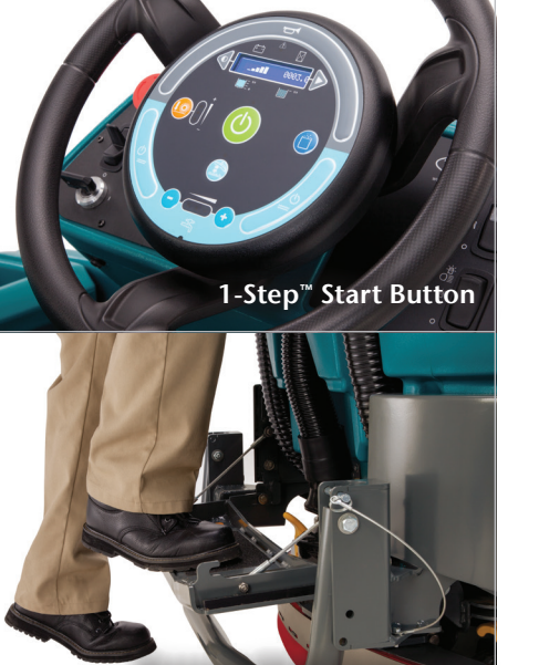
Recovery Tank Access Step

Dura-Track<sup>™</sup> squeegee leaves floors drier with a swinging parabolic design that provides uniform suction across the squeegee blade for exceptional water pickup.