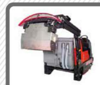
High Dump Hopper