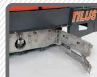
Heavy Duty Stainless Steel Components