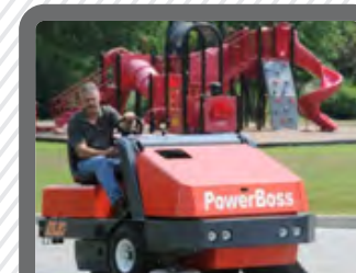
Universities • Hospitals Municipalities