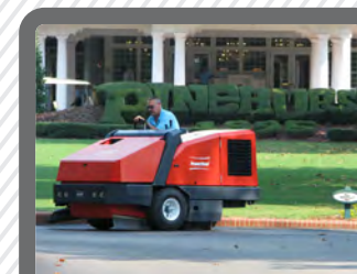
Hotels • Resorts Special Event Venues