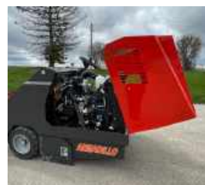
Maintenance Benefits Full engine access for easy serviceability