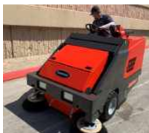
Ergonomics System Open cockpit with unobstructed view