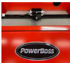
Heavy Duty Filtration Synthetic panel filter with aggressive shaker motor