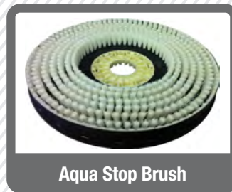
Aqua Stop Brush