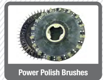
Power Polish Brushes