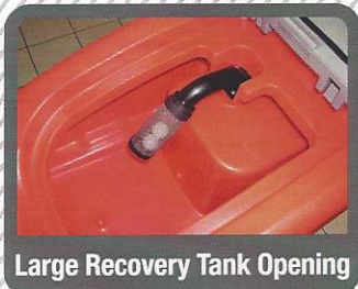
Large Recovery Tank Opening