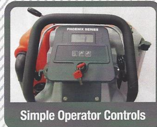
Simple Operator Controls