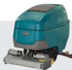
Cylindrical: 28 in / 700 mm & 32 in / 800 mm

The T600 scrubbers have multiple machine head types to fit your cleaning applications and optimize cleaning performance for specific areas.