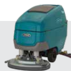
Dual disk: 28 in / 700 mm & 32 in / 800 mm & 36 in / 900 mm