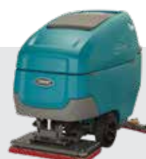
Orbital: 28 in / 700 mm