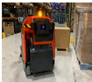
Self navigates around newly placed obstacles

Clean more areas with the ability to clean or transport through 36" doorway