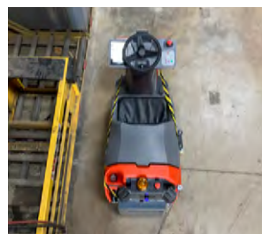
Compact design promotes superior maneuverability