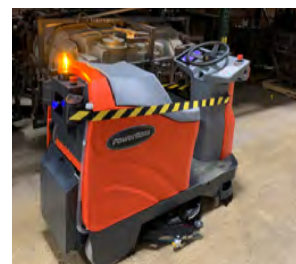
Highly visible in congested or dark aisleways